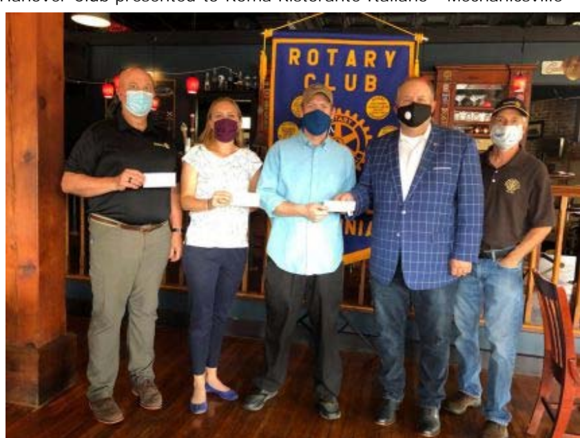
Mechanicsville Club presented to Cold Harbor Restaurant