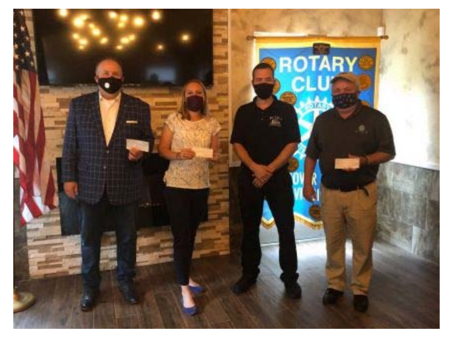
Hanover Club presented to Roma Ristorante Italiano - Mechanicsville