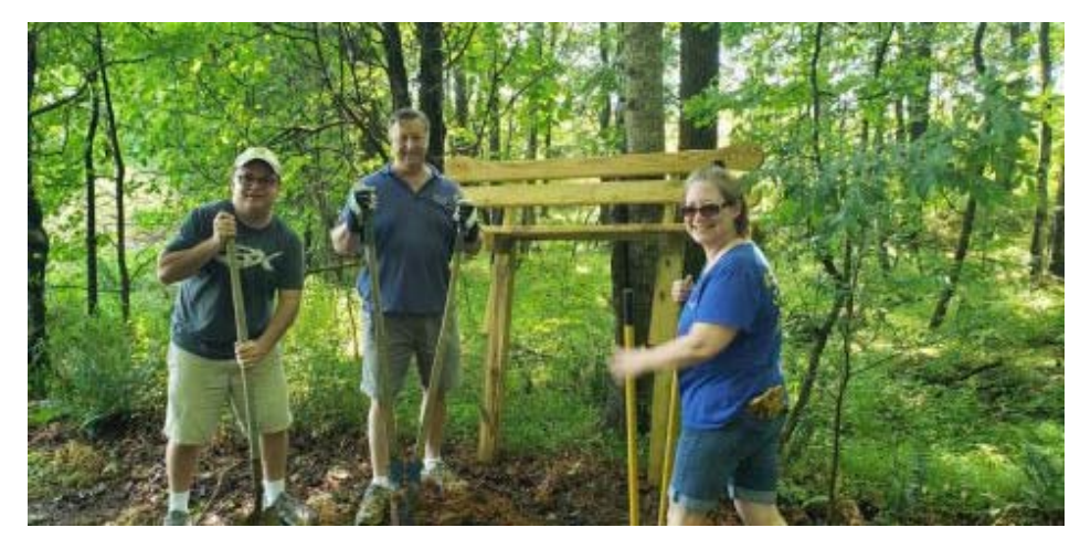
Rotary Club of Goochland Rotarians work on the new Exercise Trail and Dog Park located at Hidden Rock Park in Goochland County, VA. This project is a partnership with the Goochland County Parks & Recreation who will maintain the trail and dog park. Major funding comes from the Rotary District 7600 grant and other donors to make this a reality.