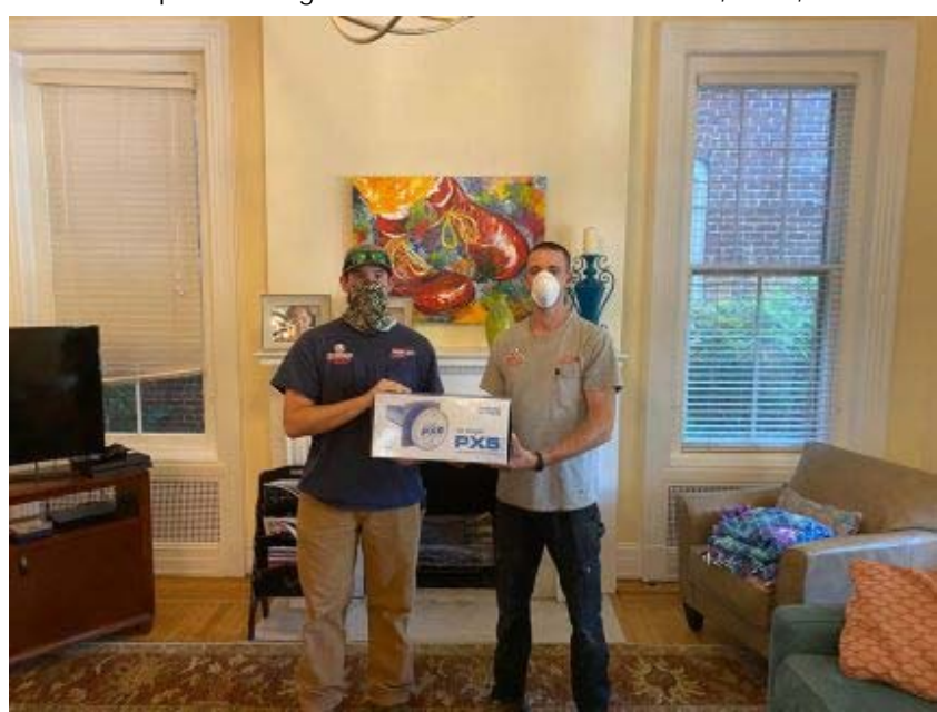
The Rotary Club of Richmond

Below - Ronald McDonald House thanks the Midlothian Club who has generously funded many of their COVID-19 safety upgrades. They are having new Air Knight filters installed all over the House to ensure safe cleaning of the air. They are so grateful for support that will bring the House up to the highest standards for the families, staff, and volunteers!