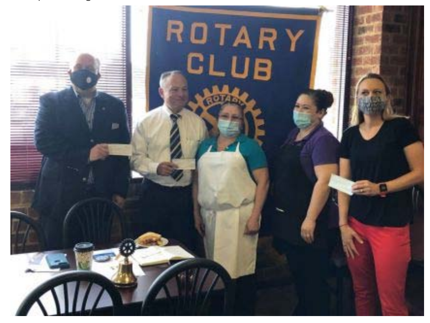
Ashland Club presented to The Iron Horse Restaurant

The three Area One clubs (The Hanover Rotary Club, the Ashland Rotary Club and the Rotary Club of Mechanicsville) partnered with Chick-fil-A Willow Lawn to help support local business, essential workers, and fire fighters during this tough time. The clubs worked together and received a district grant to provide meals to service heroes from restaurants where they normally meet. Clubs presented checks to the restaurant owners and they will start providing meals soon.