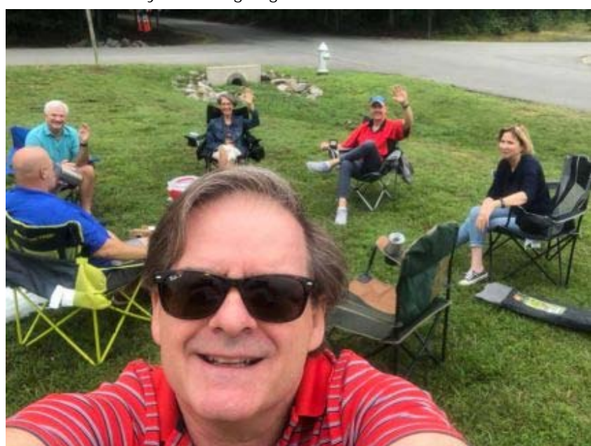
West Richmond Club: Met casually with proper social distancing.