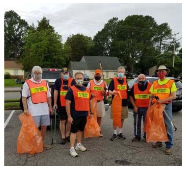
Recently members of the Hampton Roads Club spent a Saturday morning picking up trash for